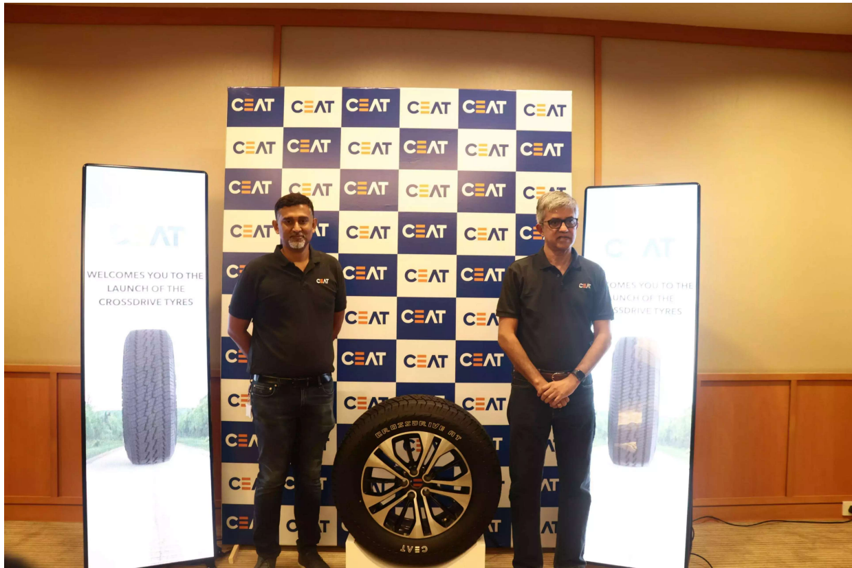
CrossDrive tyres have been specifically designed for usage across all 4X2 and 4X4 types of SUVs.

New Delhi: CEAT Ltd. , India's leading tyre manufacturer , today unveiled CrossDrive, its high-performance, all-terrain tyres for SUVs in India. CEAT has plans to launch CrossDrive tyres in the global market also.